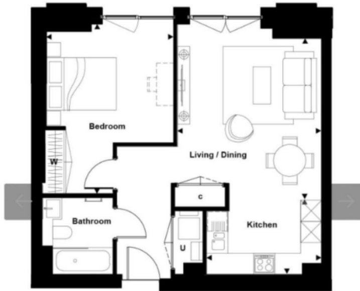
Woodberry Down, Editions - Emperor Point